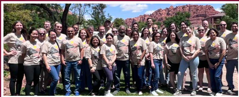
Become a Roseman Roadrunner June 2025, Pharmacy Faculty and Staff Annual Retreat