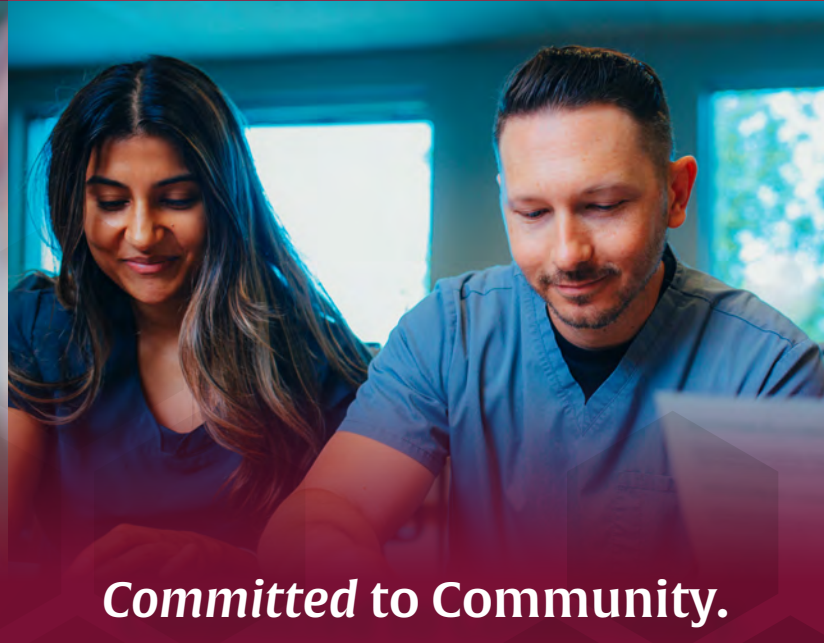
Committed to Community.